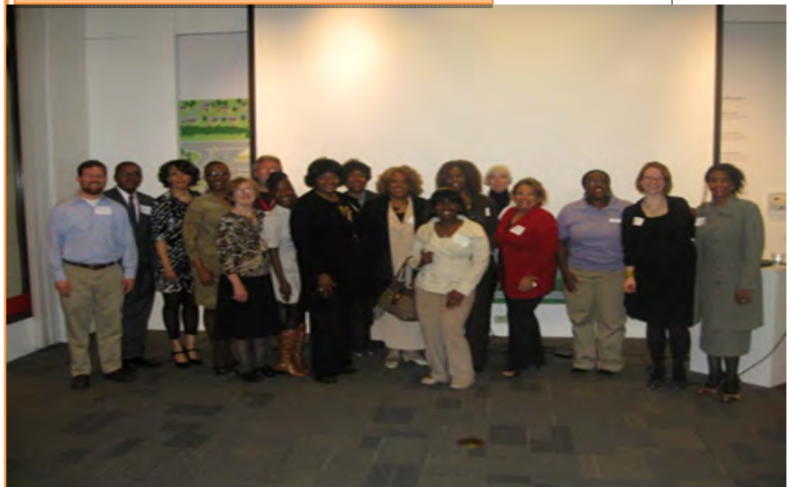
South Shore Community residents who are now certified Docents through the Chicago Architecture Foundation