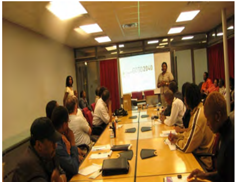
South Shore Chamber members, business owners, and residents attending the monthly chamber meeting. June’s topic was the economic changes that will be occurring in South Shore until 2040. Chamber meetings are held every fourth Wednesday.